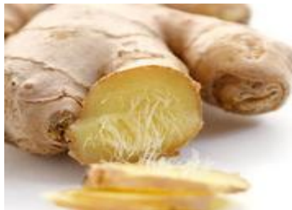
Figure showing the healthy Rhizome