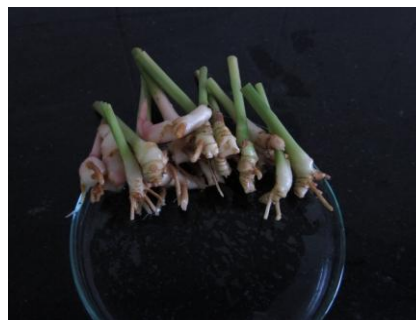
Figure showing the sterilized explants