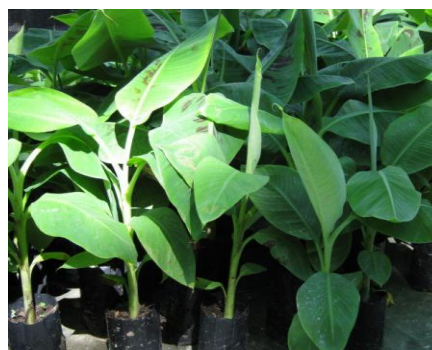
Figure showing the hardening in Green House