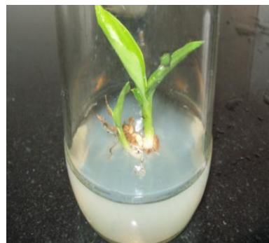
Figure showing the shoot formation