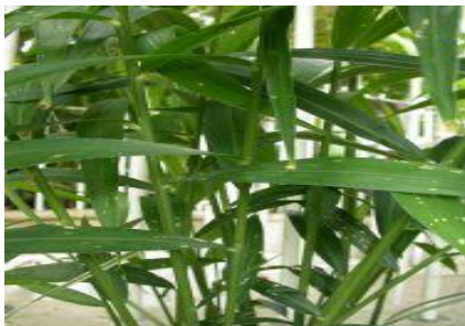
Figure showing the Young seedling

or yellowish to brown which are generally effective in stoma-tic disorders such as colic, spasm, vomiting, dyspepsia and other painful disorders.