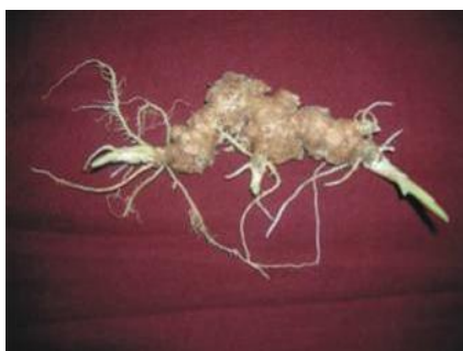
Figure showing the buds of Rhizome

The experimental material such as shoots of ginger were obtained from the Pallishree Research Farm, Arambagh(WB) and Grow Tips Biotech, Bhopal(MP) to see the different variation of weather and climate condition of the different States. Murashige and Skoog's Medium (Murashige and Skoog, 1962) with 2.0 % sucrose and 0.7% Difco-bacto agar was used as the basal medium (MS). Only analytical reagent grade chemicals and the Scott Duran with Borosil glassware's were used.