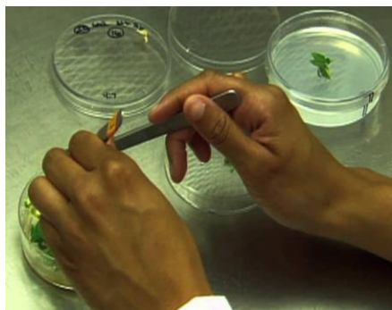
Figure showing the inoculation of explants

The current investigation on effect of surface sterilants on reducing contamination rate and per cent of healthy cultured plants. It showed that HgCl_2 is better sterilant than NaOCl in reducing contamination rate. This is because the most useful radical in HgCl_2 is probably the chlorite, commonly present as bichloride of mercury. Mercuric chloride is extremely poisonous due to high bleaching action of two chloride atoms and also mercuric ions which combine strongly with protein causing death of organism. 10 Though NaOCl consists of chlorine atom, its bleaching and disinfectant action is due to the slow decomposition of the salt to produce oxygen. The higher concentration of HgCl_2 at 0.1 per cent for 15 minutes observed more contamination and also death of the explants. This is due to the high bleaching activity of chlorine which killed the cells.